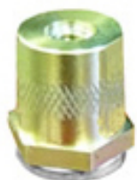
M6 - TPO6