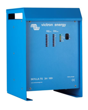
Skylla TG 24 100