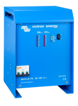
Skylla TG 24 50 3 phase