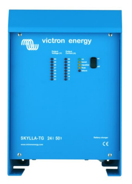
Skylla TG 24 50